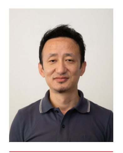
Joint ChiefTown Planner, Urban Development and Housing Department, Govt of Sikkim