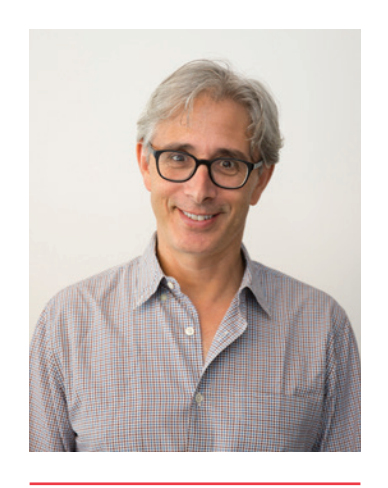
Architect and Urban Designer, Studio One Eleven